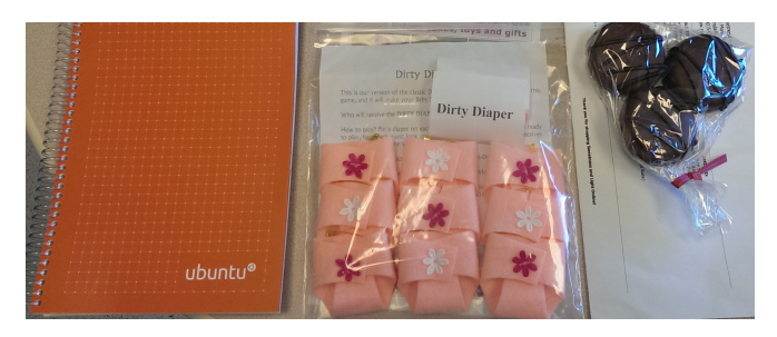
Figure 2: Received Products from Vulnerable Websites.

is still vulnerable. The added check on order ID is insufficient, thus attackers can pay for one order and bypass payments for future orders. This is one of the new vulnerabilities that we detected.